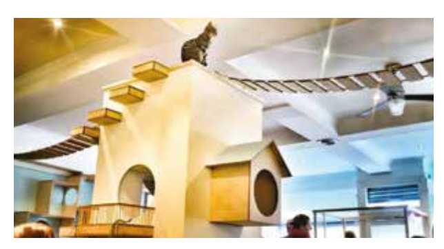
Indoor play area