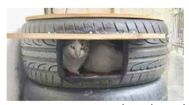
Shelters made from old tyres (strong/durable)