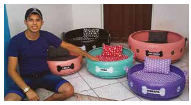
Beds made from old tyres (strong/durable)