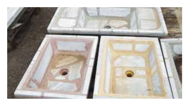
Washable food basin

If properly organised and set-up, with the help of animal loving staff and volunteers, this can become a model cultural project which can be imitated in cities island-wide who face similar problems.